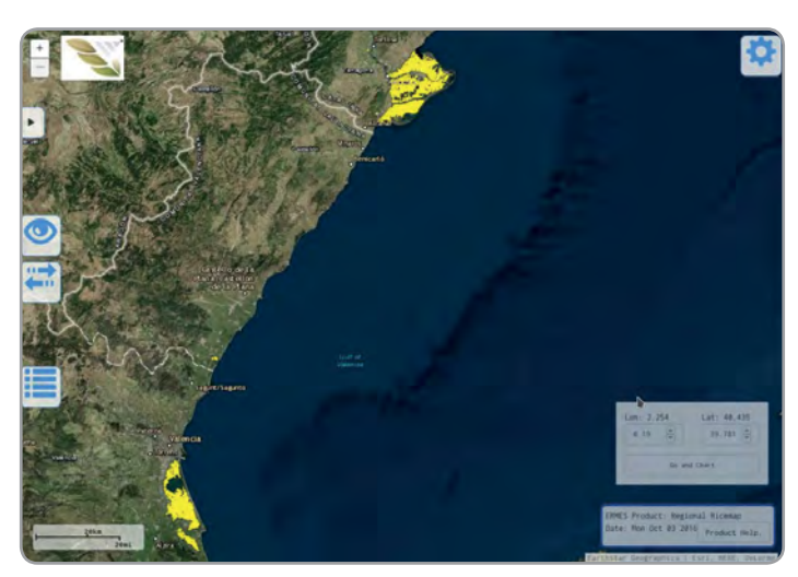
ERMES regional geoportal interface showing the rice map for the Spanish Mediterranean area. Users get access to a variety of products from crop monitoring from the eye icon on the left side.

Timely and user-friendly dissemination and delivery of these products to stakeholders were as relevant and fundamental as the products themselves to accomplish the expected benefits and impacts. A regional geoportal was specifically developed to allow efficient access to the rice-monitoring information produced for regional services.