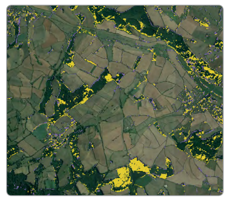
Extract from Rezatec's interactive web GIS Portal depicting the entire area of interest in the study for species identification of Sweet Chestnut and Oak derived from Sentinel data.

With an easy-to-use interface and visualised geospatial data layers, Rezatec's web portal provides an opportunity for Defra to analyse and interrogate the information and make informed decisions based on up-to-date geo-spatial data. This is a powerful outcome, supporting Defra's challenge to understand and manage this outbreak as well as potential future ones.