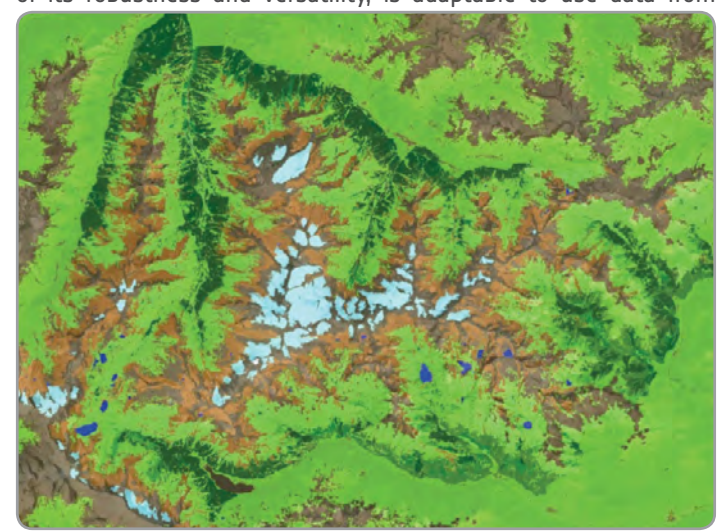
EODESM classification of land covers in Gran Paradiso National Park (NP), Italy.

The VL and the EODESM system are open to users, allowing the retrieval of environmental variables and EO data, including Copernicus datasets. A particular advantage for those charged with protecting landscapes is that consistent land cover and change classifications can be generated for landscapes across Europe. This allows better comparison of area estimates and impacts of change events (e.g., storms, fire) and processes (e.g., forest succession) between sites, including protected areas. The tools have already been applied to classify over 15 large national parks in Europe and are being increasingly adopted, as the approach to generating relevant classifications is easy to understand. The EODESM system is also scalable to any country or region worldwide and, because of its robustness and versatility, is adaptable to use data from