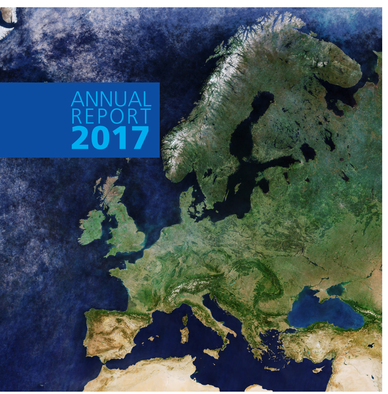
Cloud-free Europe 27/04/2018 10:00 am contains modified Copernicus Sentinel data (2017), processed by Sinergise/ESA