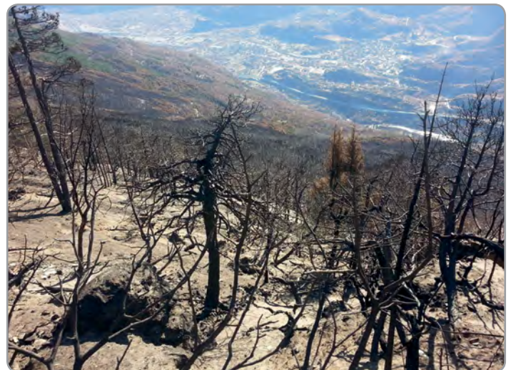
Burnt areas in Val di Susa, Città metropolitana di Torino after the forest fires in October 2017.

The main benefits of the EO space-based solution is mainly in terms of safety of citizens and infrastructures. Intersecting the burnt areas with the in-situ data of provincial authorities (e.g. urban areas strategic infrastructures, risk zones) enables to carry out timely risk analyses in the affected areas, e.g. debris flow risk, safe mobility planning, allowing preventive measures to be assessed (also in terms of costs), prioritised and planned. Furthermore, the availability of a comprehensive burnt areas database (a strict user's requirement) derived by satellite imagery efficiently supports administrative processes foreseen by national regulations in case of fires events (e.g., prohibitions