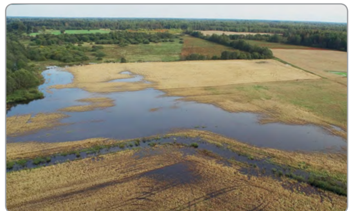
Severe rain caused flood at the beginning of harvesting season in Eastern Latvia.

Use of Sentinels and drones shortened time for field visits by a third. Faster field visits saved plenty of administration costs (fewer working hours, less driving to visits). 3100 farmers with 82000 ha of damaged area received their compensation for yield loss in less than two-months after the first day of rainfall. That was an unprecedented speed for emergency administration - from field visits to payments.