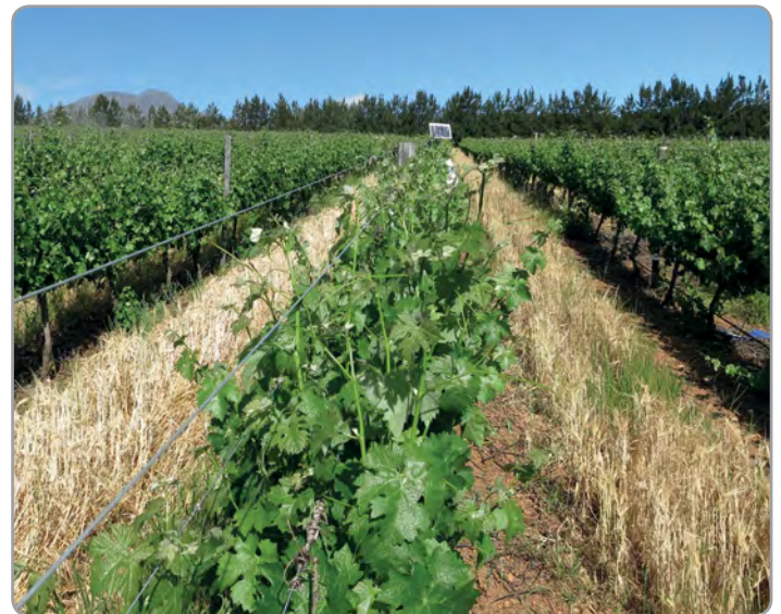
200,000ha of vineyards and orchards are monitored by FruitLook on a weekly basis

The current drought in the Western Cape is deemed the worst in more than 100 years. Under these circumstances every drop literally counts. With FruitLook farmers are empowered to make better management decisions which are reflected in the efficiency and productivity of their water use. Farmers use FruitLook to monitor