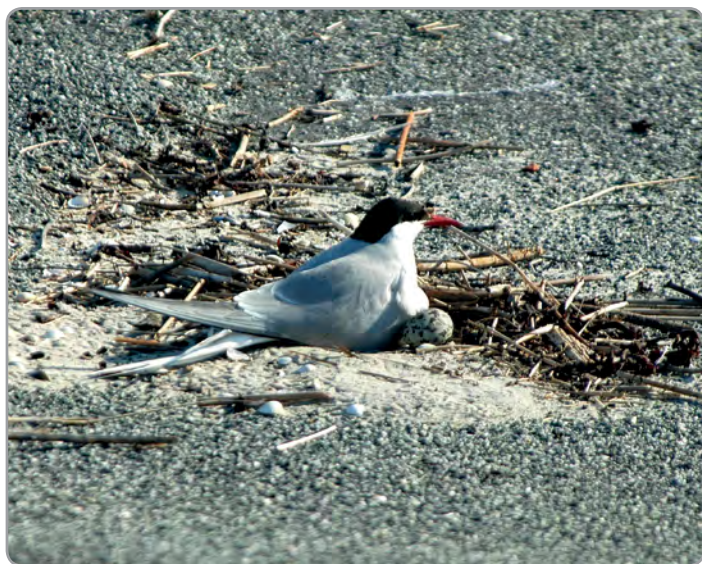
One of the many nesting avian species residing in the Wadden Sea.

trade-offs, and management strategies' impacts over time, helping inform on the decrease of birds whilst simultaneously providing data on key ecological indicators. Earth observation is much more cost-effective and less time consuming than monitoring programmes which require expensive vessels to conduct missions. Satellite images record near real-time observations; resulting maps are used to visualise and explain trends to policymakers. Moreover, space-based observation allows users to acquire continuous spatio-temporal data, improving the overall monitoring practices in the Wadden Sea. Earth observations, derived products and models used for the Wadden Sea support decision making and inform measures to protect and conserve this unique ecosystem.