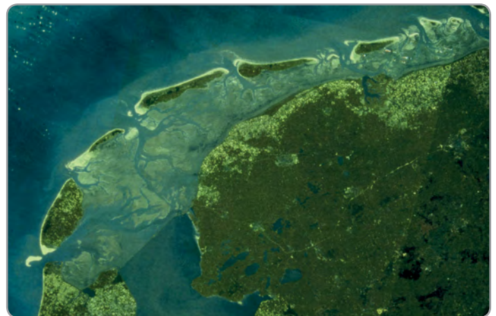
Composite optical remote sensing image of the Dutch Wadden Sea, highlighting the intertidal mud flats.

the Wadden Sea can be made. By incorporating the policy and management strategies into the modelling regime, impacts of the strategies on various ecosystem services and functions can be deduced by interpreting the resulting indicators. Additionally, Earth observations used by national and regional monitoring agencies can be used in conjunction with statistical modelling activities, such as Bayesian Networks, which are able to describe ecosystem services and highlight their potential trade-offs through probabilistic impact relationships. These networks are trained with a combination of remote sensing data and an ensemble of model outputs which aim to capture the impacts of management scenarios. This generates relationships between proposed policy and expected outcomes based on data.