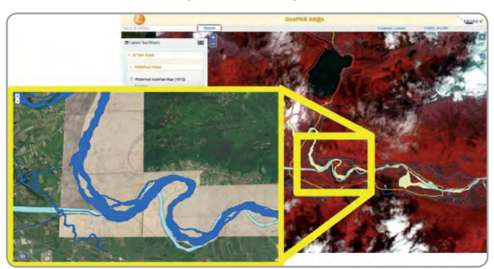
GeoPAN APP: integration of Sentinel-2A data, historical maps and shapefiles from the local (Lombardy) SDI to track riverbed changes. Credit: Contains modified Copernicus Sentinel data [2016]

The GeoPAN application has been extremely well received in professional environments such as the Association of Geologists as it provides a quick and easy way to track landscape transformations that have occurred across the centuries. Monitoring of such changes enables PAs to make more informed decisions regarding environmental monitoring and risk mitigation actions.