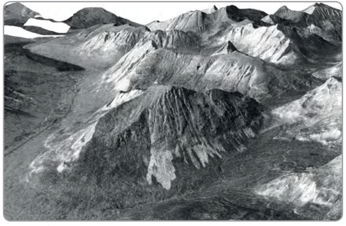
3D view of a Sentinel-1 radar backscatter image with avalanches visible in the foreground in light grey.

Public, regional avalanche forecasts mainly target two user groups: Winter backcountry users, the group with the vast majority of avalanche fatalities, and public entities, responsible for infrastructure planning and road safety. Both user groups use the forecast as a risk reduction measure, depending greatly on its accuracy and predictive power. However, avalanche forecasting is inherently forecasting of uncertainty expressed in probabilities of avalanche release. Moreover, it is a complex, synoptic decision making task carried out by an expert. Our avalanche activity datasets decrease the uncertainty of the forecast, as released avalanches are the best available sign of prevailing avalanche hazard. This gives the forecasters an improved tool for their risk assessment and ultimately a higher quality avalanche forecast for the end users. The ultimate goal of an avalanche forecast is to prevent fatal avalanche accidents. Our service contributes to achieving this important goal.