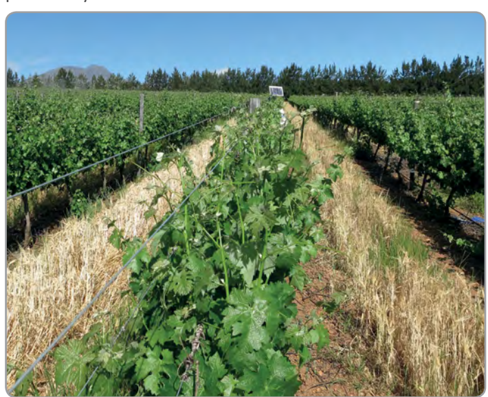
200,000ha of vineyards and orchards are monitored by FruitLook on a weekly basis

The current drought in the Western Cape is deemed the worst in more than 100 years. Under these circumstances every drop literally counts. With FruitLook farmers are empowered to make better management decisions which are reflected in the efficiency and productivity of their water use. Farmers use FruitLook to monitor