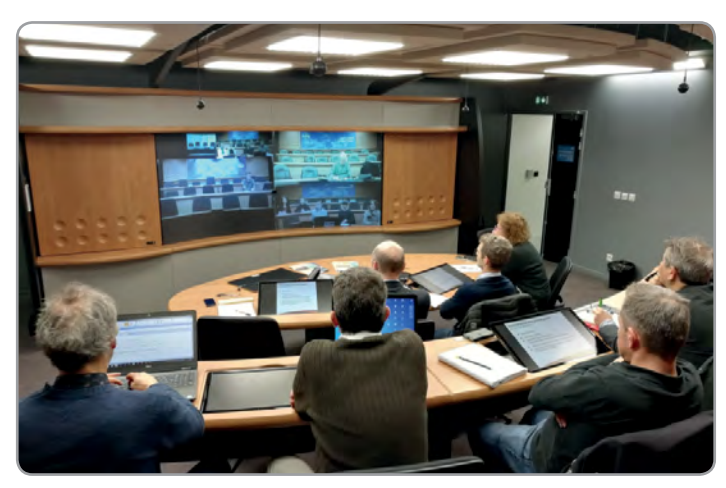
First meeting of the working group across 5 cities (Brest, Lannion, Lorient, Rennes, Vannes).