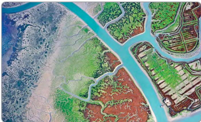
"The intricate network of channels and creeks contrasts with the regular shapes of transformed saltmarsh (right of picture)," writes Edward P. Morris, Sentinel-2 'Colour vision' photo competition.

Worldwide coastal coverage allows citizens to become informed on the importance of their natural coastline for reducing flood risk. The comprehensive dataset and modelling tool is contributing to the assessment of the status of regional coastal zones for managers and policymakers. For managers and engineers, the interface is a way forward towards utilising the vastly increasing