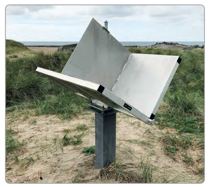
Corner reflector developed by DTU Space & Agency for Data Supply and Efficiency and manufactured by Lemvig Utility. Reflectors serve to link height variations in EO data to the Danish datum network.

The reflectors link to the Danish height system and to the bottom of sewers via traditional leveling techniques. This provides very detailed and precise determination of height changes over time and secures cross-sectorial use e.g. in the construction sector thereby making EO results applicable to the public.