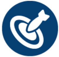
Security and Defense